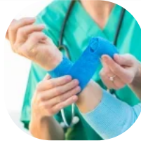
Critical Wound Dressing