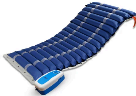
PATIENT CARE AIR MATTRESS & TUBE AIR MATTRESS FOR BED SORE PREVENTION