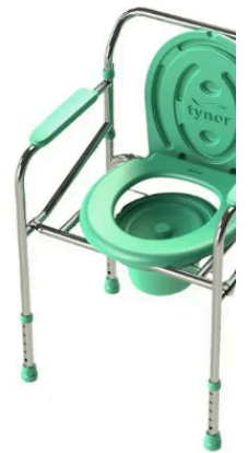
PATIENT CARE COMI TOILET SAFTEY P