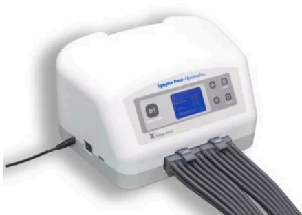
EFFECTIVE PREVENTION & MANAGEMENT OF DVT LYMPHA PRESS

Angel Meditech: Delivering Care Through Quality Equipment